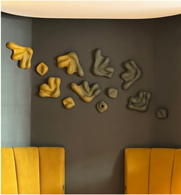
Petrichor I & Petrichor II | 60" w x 42" h x 4" d PG Plaza | Hyattsville, Maryland – 2025 Commissioned by ISG, Inc.

Created for a shared gathering space within a condominium residence, Petrichor I and Petrichor II respond to two opposing alcoves with curved banquette seating. Each composition uses a gradient that transitions from mustard tones in the upholstery into layered greens drawn from the surrounding interior, establishing visual continuity while allowing each piece to respond to its specific architectural setting. The modular compositions were developed to accommodate evolving millwork details, allowing for on-site adjustments in coordination with the interior design team.