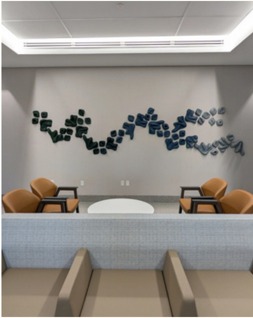
Breathe | 15' w × 40" h x 4" d Methodist Medical Center | Celina, Texas — 2025 Commissioned by Skyline Art

Installed in the Emergency Room lobby, this work was developed using evidence-based design principles appropriate for acute care environments. The palette transitions from green into blue and grey, selected for their stabilizing qualities. Following an architectural revision, the composition was expanded from ten to fifteen feet and adapted to a new location while maintaining consistency in color and scale. The piece was fabricated within OSHA requirements limiting total depth to four inches, including mounting hardware.