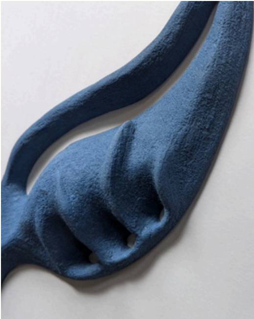
Blue Botany | 36" w x 30" h x 4" d Indianapolis, Indiana, 2024 Commissioned by Skyline Art

Blue Botany was created for the Healthcare Design Conference held in Indianapolis Indiana. The design needed to be modular in nature for efficient logistics and display in numerous environments.