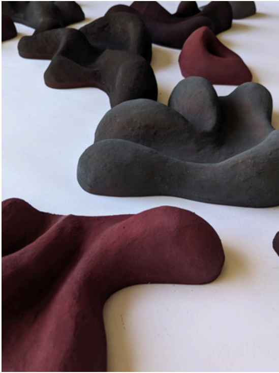
Desert Blush | 15' w x 4' h x 4" d Atrium Rehab Center | Charlotte, North Carolina — 2025 Commissioned by Skyline Art

Created for a medical rehabilitation facility, this work introduces warmth and material variation within a primarily functional environment. The composition spans fifteen feet across a primary interior wall, using a palette of sandy browns, purples, and muted rose tones to maintain visual interest while remaining calm for extended viewing. The piece was developed to meet OSHA requirements limiting total depth to four inches, including mounting hardware, while preserving surface dimensionality.