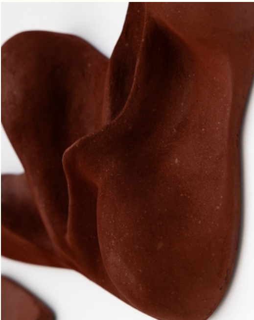
Little Fish | 60" w × 42" h x 4" d Methodist Medical Center | Midlothian, Texas — 2025 Commissioned by Skyline Art

Installed on an inpatient floor in a window overlook area, this work introduces a controlled field of color within a quieter hospital setting. The palette transitions from blue into green and rust, balancing cooler and warmer tones within the space. The piece was developed in alignment with healthcare design considerations and fabricated to meet OSHA requirements limiting total depth to four inches, including mounting hardware.