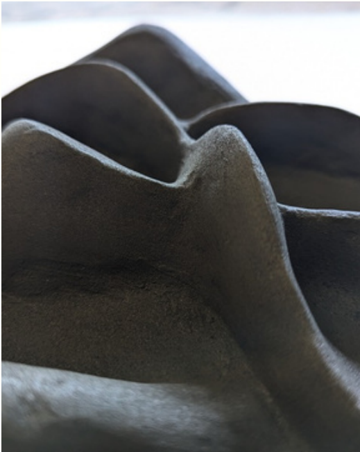
Olive Matrix | 18" w x 15" h x 5" d Sawyer Yards | Houston, TX - 2024 Commissioned by Vida Designs

Created for a shared co-working space in a mixed use residential development.